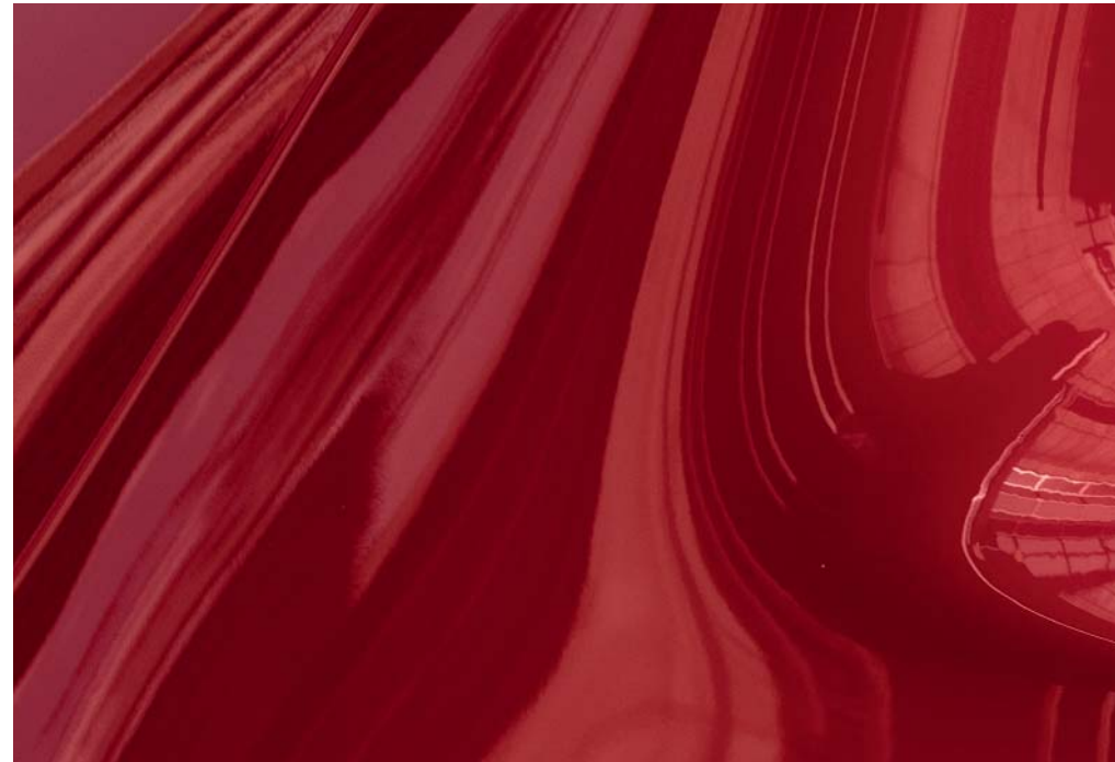
Soul Red Crystal Metallic