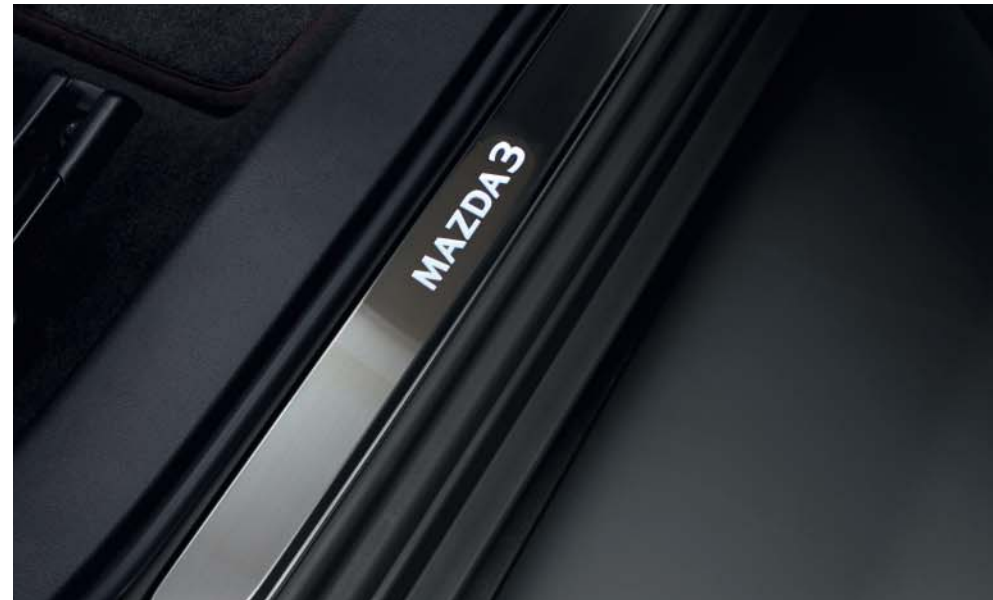
Illuminated Scuff Plates