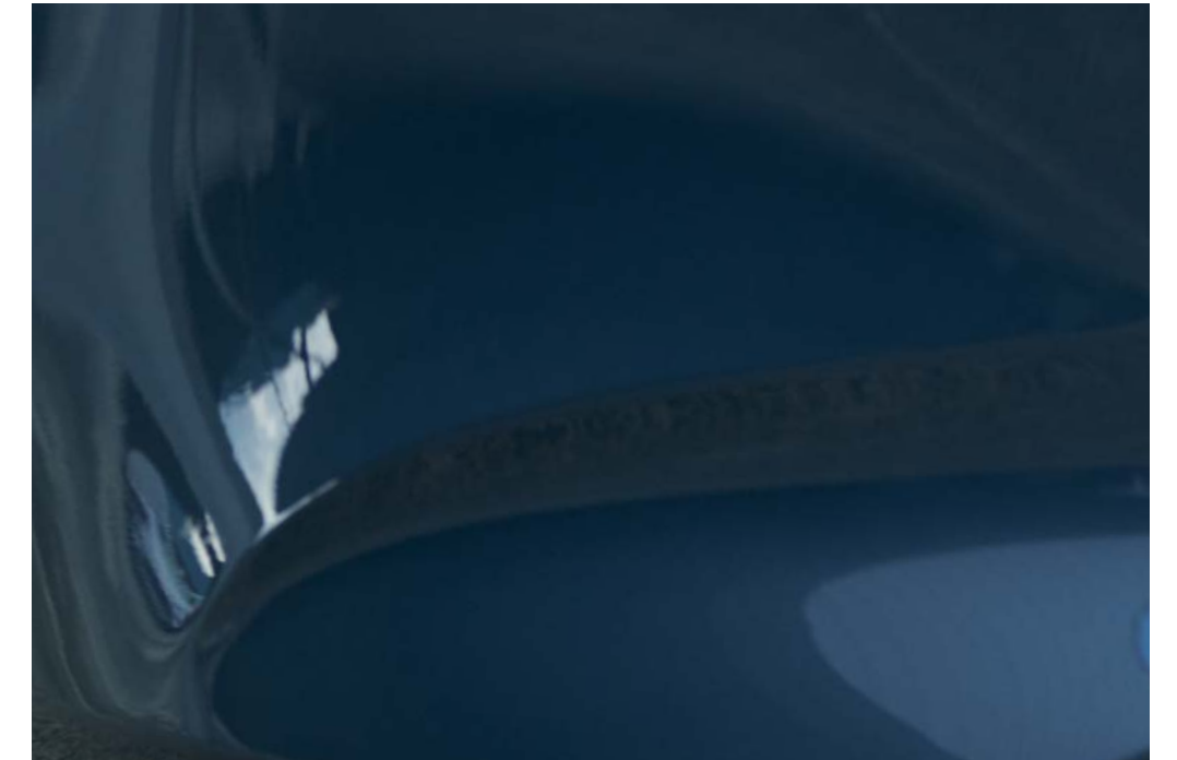
Polymetal Grey Metallic