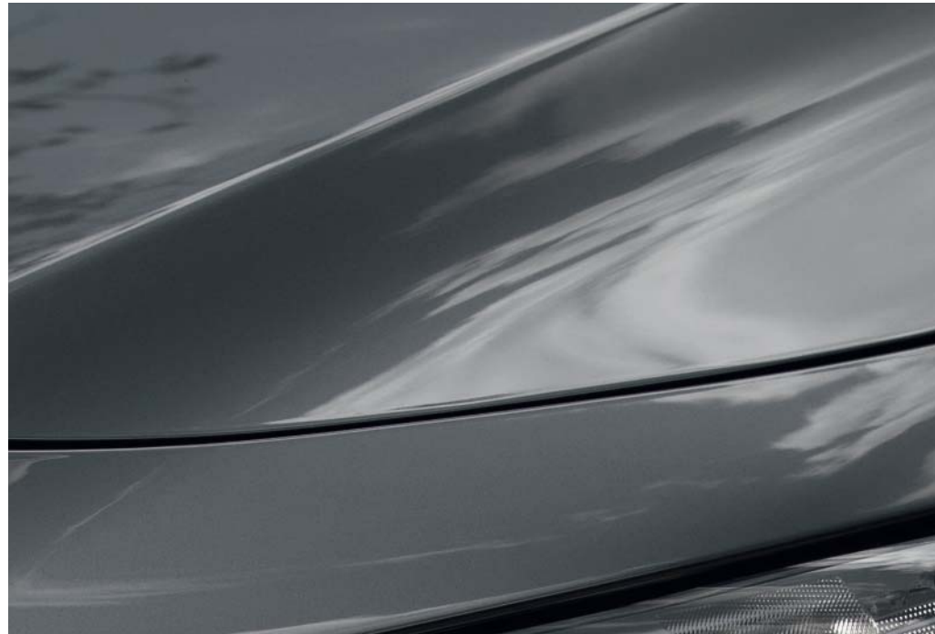
Machine Grey Metallic

The colour on the All-New Mazda3 is one of the first things that will catch your attention. Our new Polymetal Grey Metallic paint, available on hatchback models, possesses an entirely new appearance. A daring mixture of bright aluminum flakes and opaque pigment illuminates the beautiful characteristics of Kodo design. In one environment, light reflects vibrancy. In shade, it can strike an expression of warmth. Design and colour work in creative harmony to express a smooth and seductive appeal.