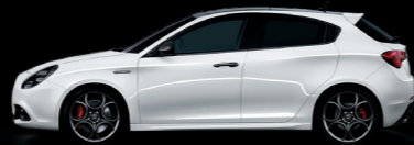
217 Alfa White