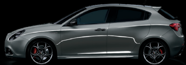
318 Stromboli Grey