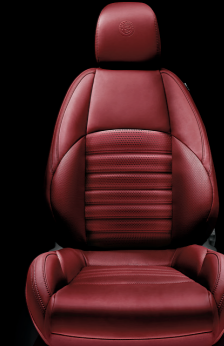
Leather 401 Red (opt)