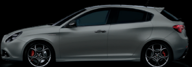
529 Magnesio Grey