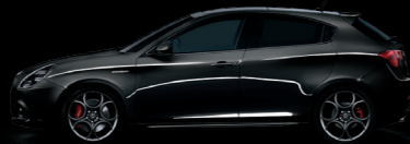
601 Alfa Black