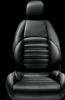
Leather 408 Black (opt)