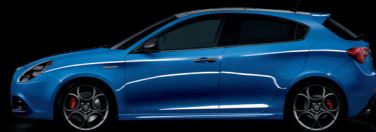
756 Misano Blue