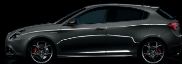
409 Lipari Grey