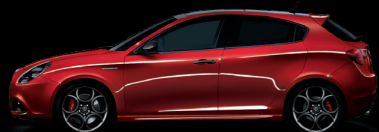
361 Competizione Red