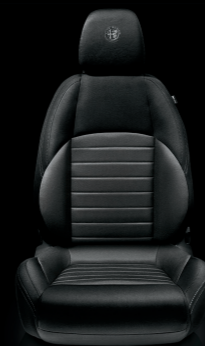
Two-colour fabric 123 Black-Dark Grey (standard)