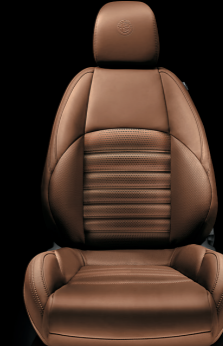
Leather 465 Tobacco (opt)