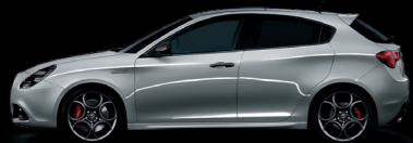
620 Silverstone Grey