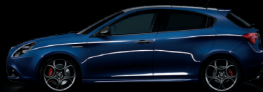
486 Anodizzato Blue