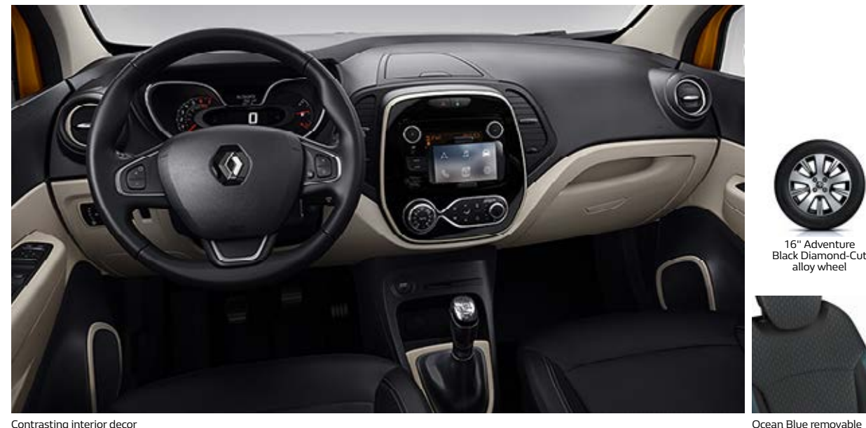
Contrasting interior decor