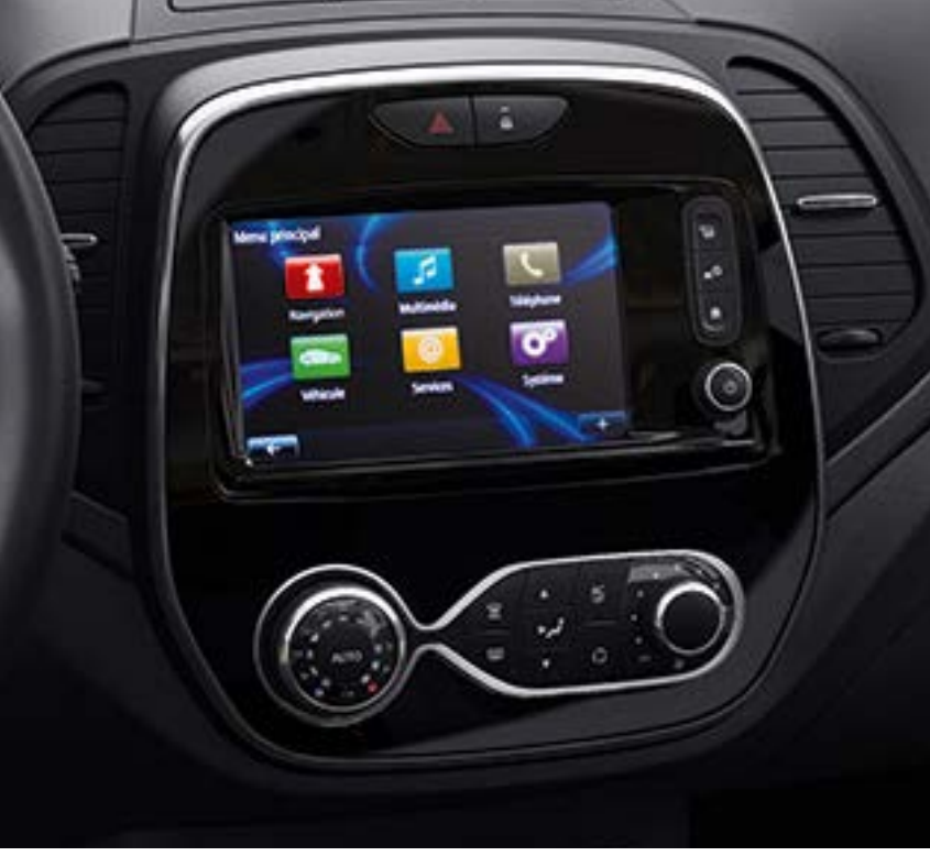
R&Go, the new application : by simply connecting your smartphone to the car radio, you can access the R&Go functions: Six icons let you follow an itinerary, control the driving mode, manage the radio, safely make and receive phone calls, etc.