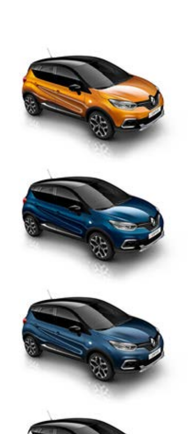
Atacama Orange (SEC) Starry Black roof (SEC)