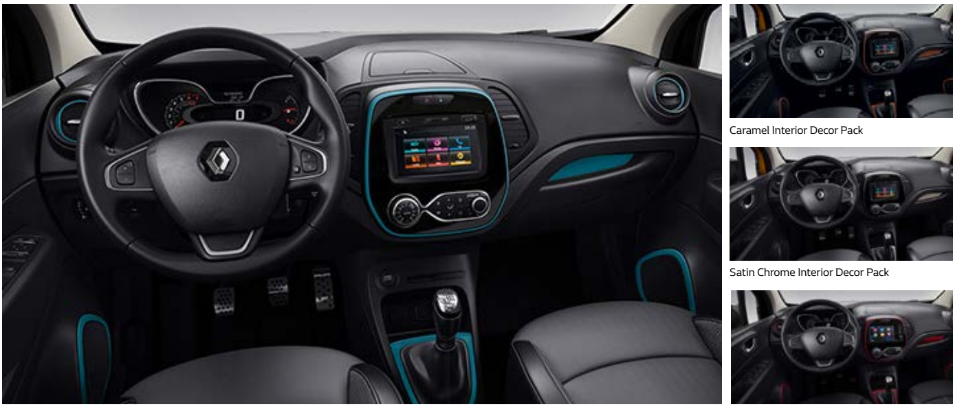
Ocean Blue Interior Decor Pack