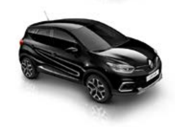
Starry Black (SEC) Mercury (SEC) Roof