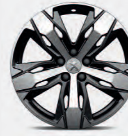
18" 'LOS ANGELES' Two-tone diamond-cut alloy wheels** (linked to Advanced Grip Control®)