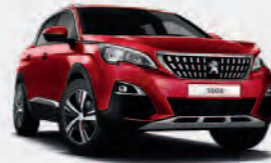
Ultimate Red** (Special)