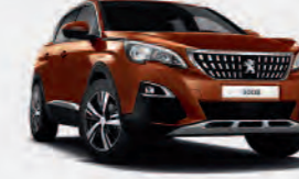
Sunset Copper** (Met)