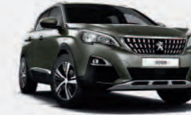
Amazonite Grey** (Met)