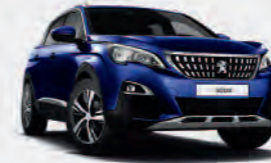
Magnetic Blue** (Met)