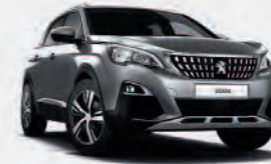
Cumulus Grey** (Met)