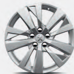
17" 'CHICAGO' alloy (standard on Active versions)

*Optional on Active versions **Optional on Active and Allure versions