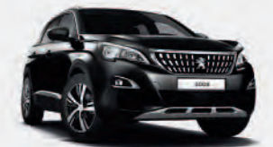
Nero Black** (Met)