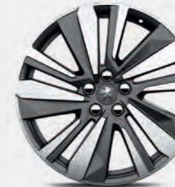
19" 'WASHINGTON' Two-tone diamond-cut alloy wheels (optional on Allure versions)