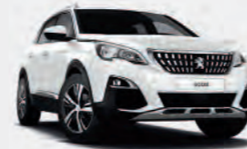
Bianca White** (Solid)