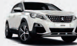
Pearl White** (Pearlescent)