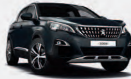
Hurricane Grey* (Solid)