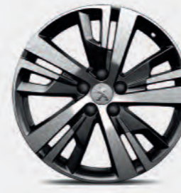
18" 'DETROIT' Two-tone diamond-cut alloy wheels* (standard on Allure versions)