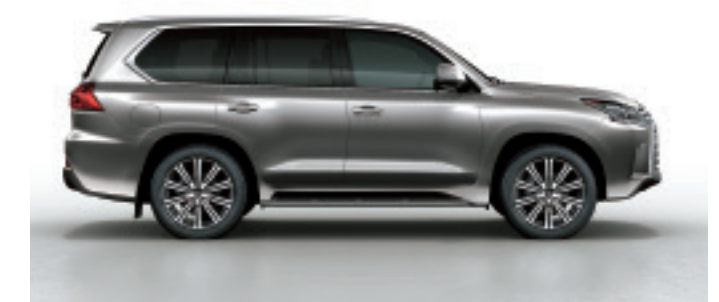
Sonic Titanium <1J7>