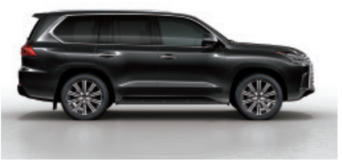
Starlight Black Glass Flake <217>