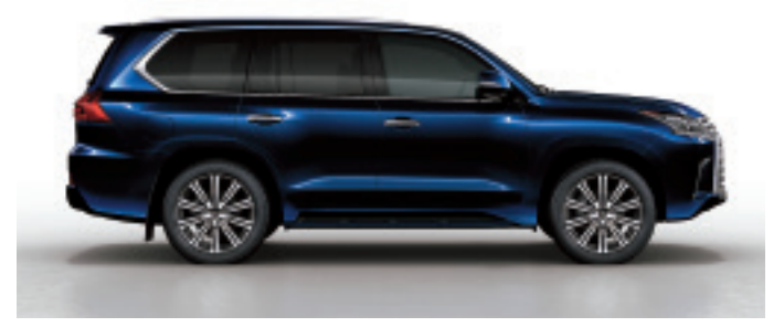
Deep Blue Mica <8X5>