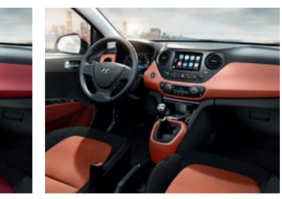
Black and Orange