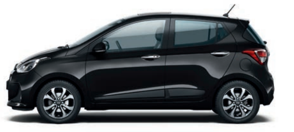
Phantom Black (Pearl)