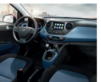
Black and Blue