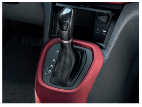
4-speed automatic. The smooth-shifting automatic takes the stress out of busy city driving.