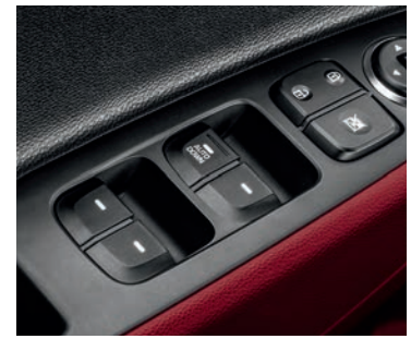
Rear power windows. Unusual in this class, the windows in the rear doors can be raised and lowered at the touch of a button.