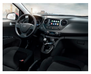
Black and Dark Grey