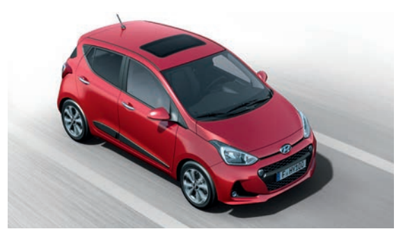
Lane Departure Warning System (LDWS). Warns you audibly and visibly of unintended departure from the traffic lane, when detected by the multi-function camera.