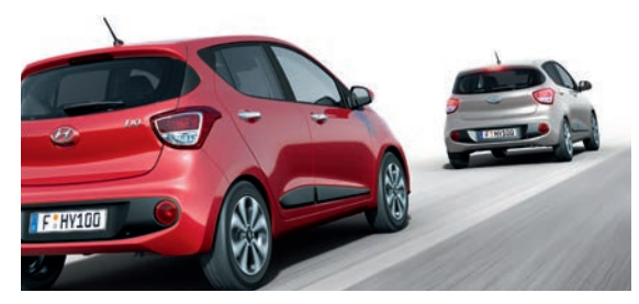
Front Collision Warning System (FCWS). Peace of mind on the move is provided by FCWS that provides a warning of a potential collision with the vehicle in front.