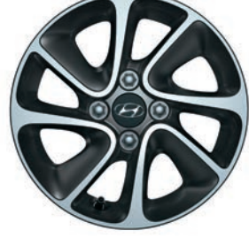
14" 8-spoke Design alloy wheel (metallic grey)