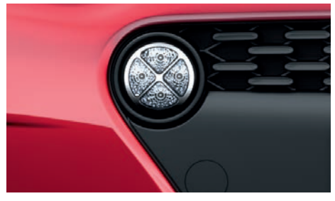
LED Daytime Running Lights. The new round LED Daytime Running Lamps add an extra touch of sportiness to the front of the i10.