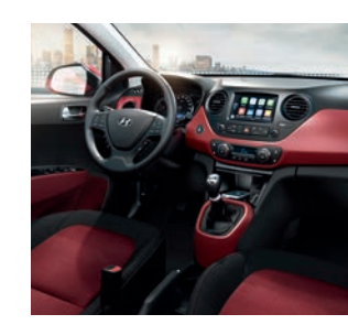
Black and Red