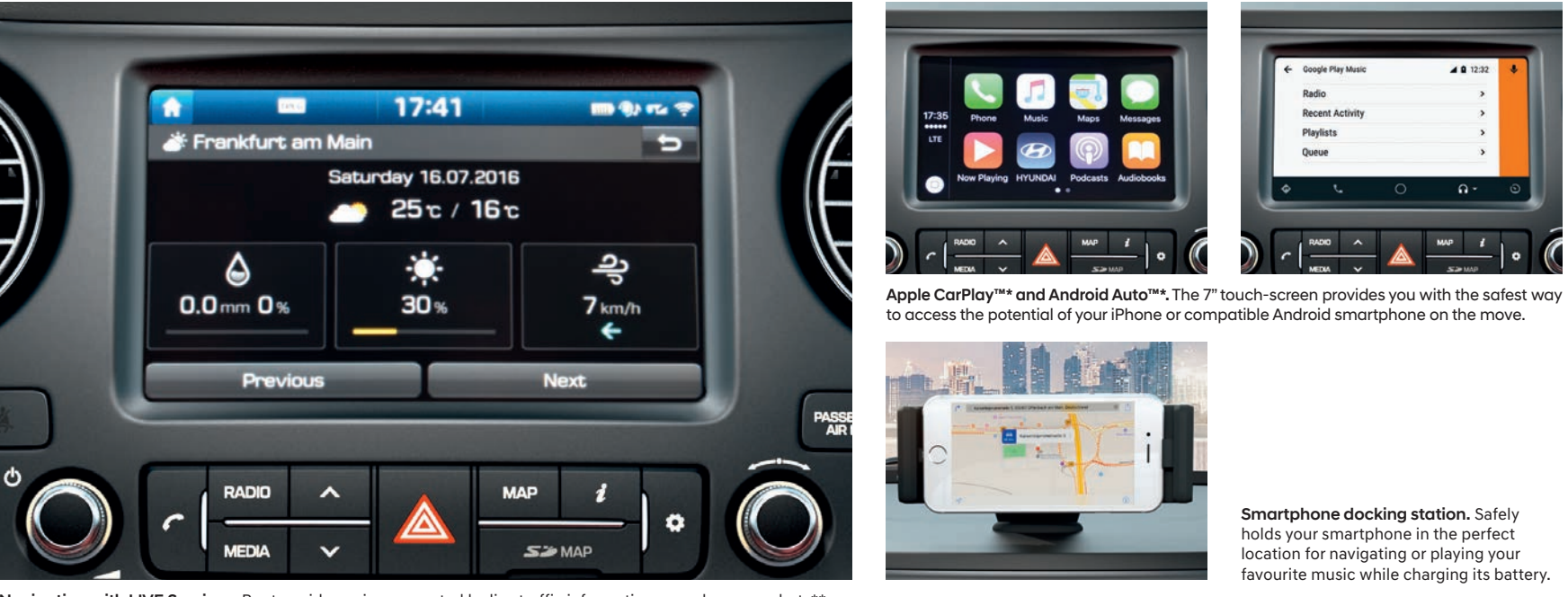
Navigation with LIVE Services. Route guidance is augmented by live traffic information, speed camera alerts**, weather conditions and point of interest data.

Advanced connectivity is just one of the qualities that position the i10 at the top of the segment. There's a new navigation system with LIVE Services, Apple CarPlay™ * links with iPhones, and Android Auto™ * connects with compatible Android smartphones. So you can always be informed, in touch and entertained.