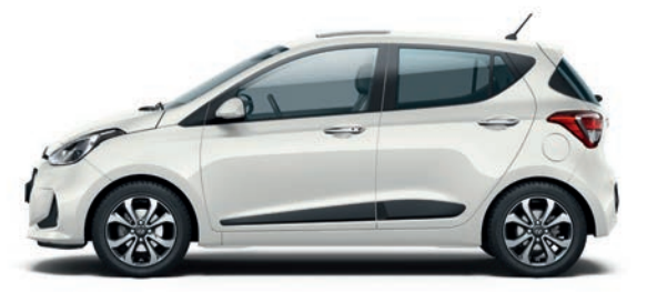
Polar White (Solid)

Combine your selection of exterior colour, wheels and interior fabrics to create your ideal new i10.