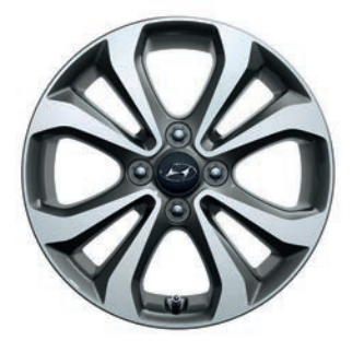
15" 4-twin-spoke Design alloy wheel (metallic grey)