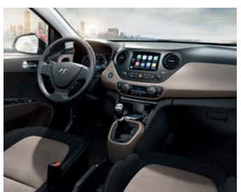
Black and Beige