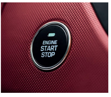
Engine Start/Stop button. When you're on board with the smart key in your pocket or in your bag, keyless push-button starting is enabled.