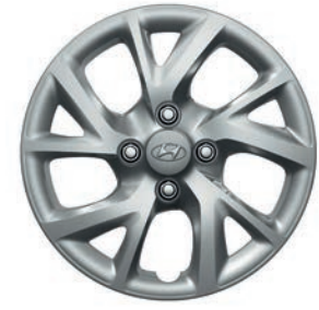
14" 5-twin-spoke Design wheelcover (metallic grey)