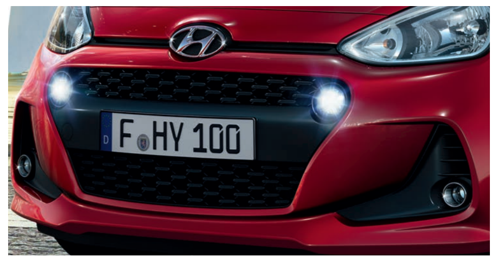
Cascading grille. The expressive shape of the new Cascading grille emphasizes the confident character of the i10.

The established shape of the i10 has been given a sporty new attitude that really catches the eye. There's a totally new sculpted front bumper that's also home to the new Cascading grille and prominent LED Daytime Running Lights. New wheels, a contrasting rear bumper insert and redesigned rear combination lamps complete the picture.