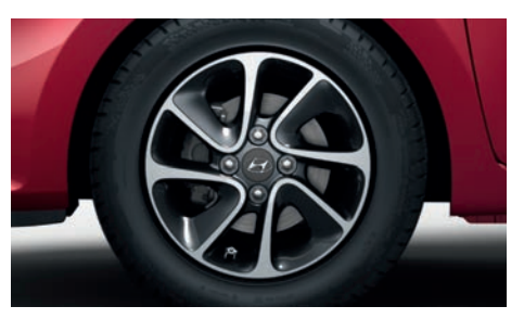
New wheels. Just one of the four available wheel designs, the sporty 14" alloy wheel contributes to the bold new attitude of the i10.