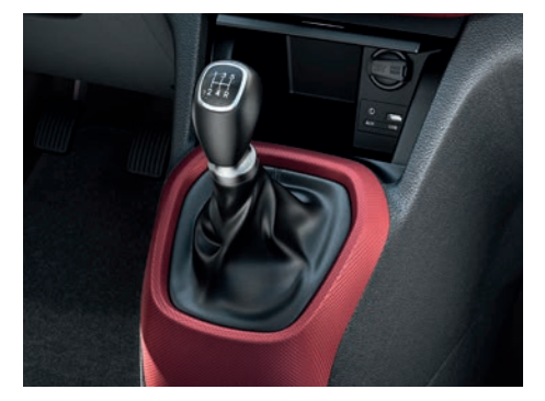
5-speed manual. Precise manual gearshifts bring extra driving pleasure, especially on country roads.

Refined engines and transmissions provide all the performance you need combined with low fuel consumption and low emissions. Choose between a 66 PS 1.0 | 3-cylinder petrol engine, an 87 PS 1.25 | 4-cylinder unit, and a 67 PS LPG version of the 1.0 |. The engines are mated to either a precise 5-speed manual transmission or a smooth-shifting 4-speed automatic. The gearshift is located conveniently high for easy operation.