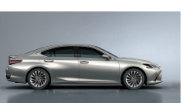
Ice Ecru Mica Metallic <4X8>