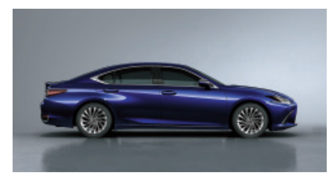
Deep Blue Mica <8X5>