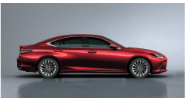
Red Mica Crystal Shine <3R1>