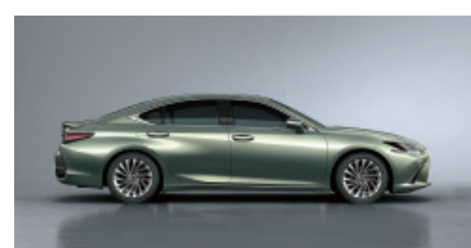
Sunlight Green Mica Metallic <6X0>