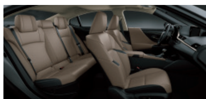
uu Topaz Brown