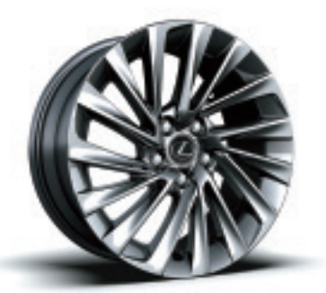
18-inch aluminum noise reduction wheels